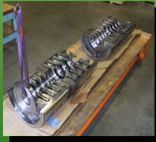
Complete Internal Assy.